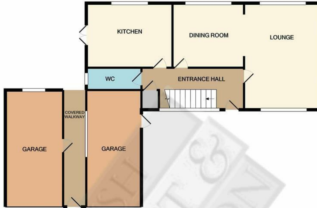
GROUND FLOOR APPROX. FLOOR AREA 894 SQ.FT. (83.1 SQ.M.)