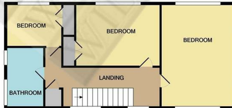
1ST FLOOR APPROX. FLOOR AREA 561 SQ.FT. (52.1 SQ.M.)

TOTAL APPROX. FLOOR AREA 1455 SQ.FT. (135.2 SQ.M.)